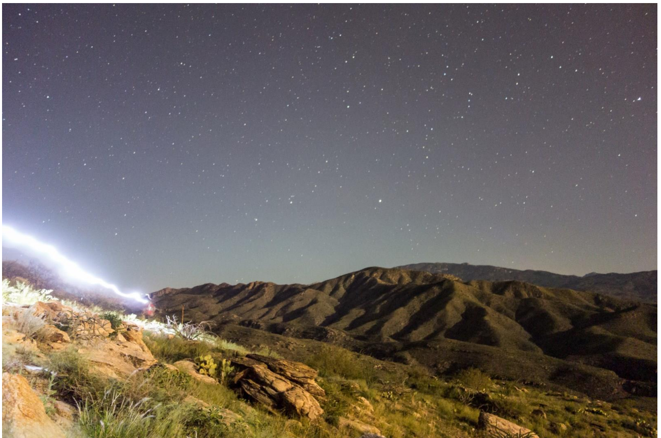
Night on the Babad Do'ag Trail - hiking by headlamp. September 2014.