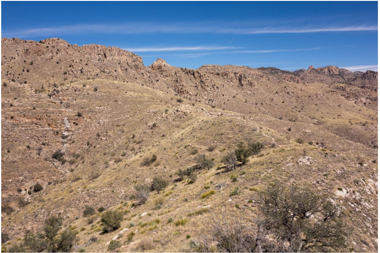
Looking down on the Babad Do'ag Trail at the split with the un-official trail to Point 4780. February 2014.